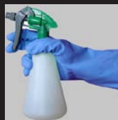
SPRAY & WIPE