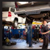
AUTOMOTIVE WORKSHOP CLEANING