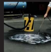
EMERGENCY SPILL RESPONSE